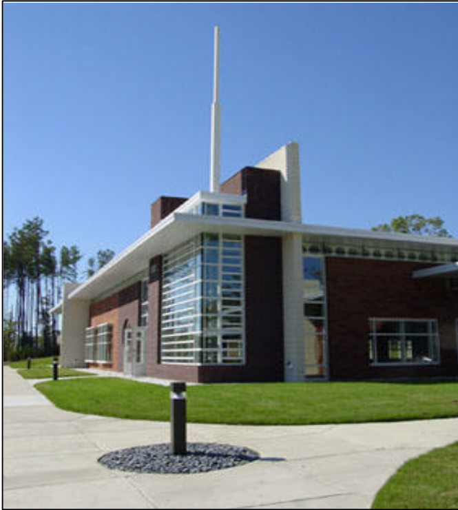
5310 South Alston Avenue (RTP) Durham, NC

Beautiful three-building office campus located on the cusp of RTP. Just off the intersection of South Alston Avenue and TW Alexander Drive. Conveniently located near RDU Airport.